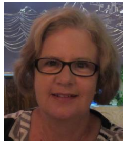
JOY MATER TASMANIA